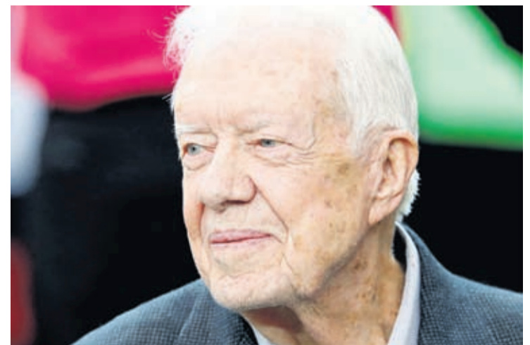
Former President Jimmy Carter sits on the Atlanta Falcons bench before the first half of an NFL football game between the Atlanta Falcons and the San Diego Chargers, Oct. 23, 2016, in Atlanta.